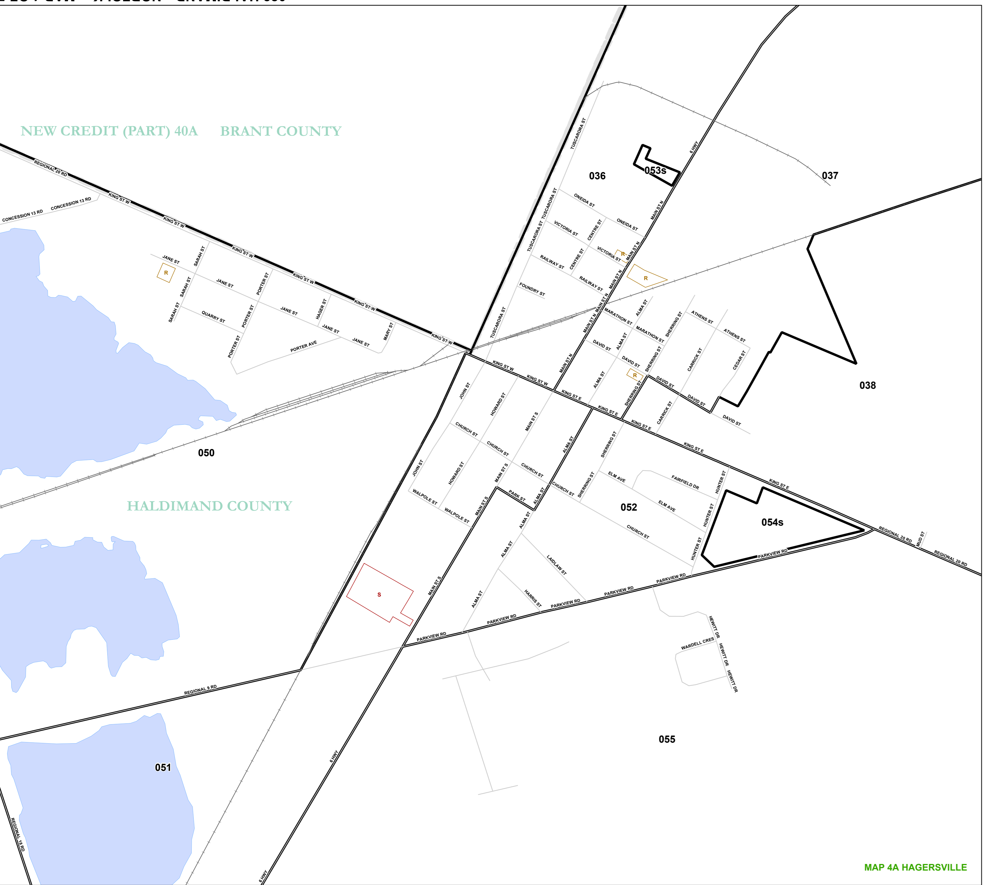
MAP 4A HAGERSVILLE