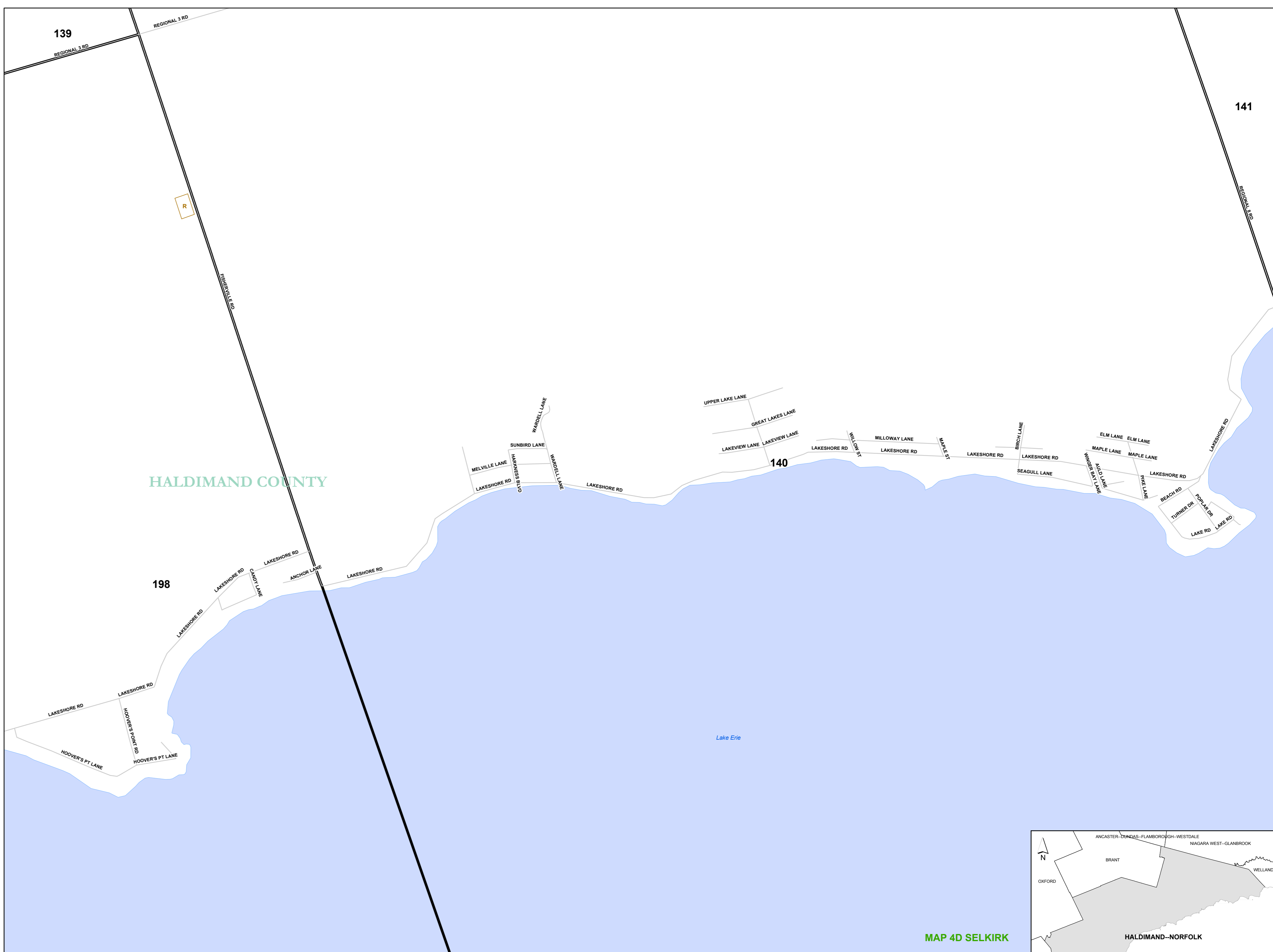
MAP 4D SELKIRK